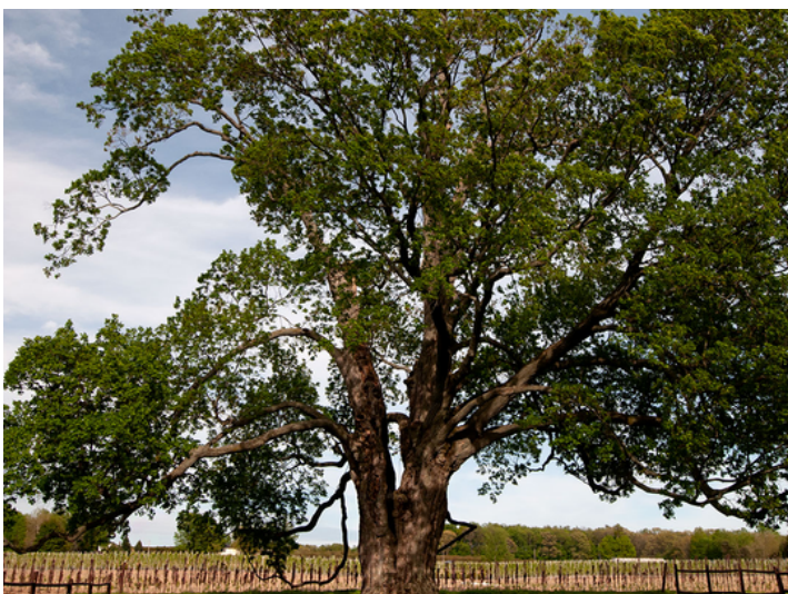
Comfort Maple in Pelham, Ontario.