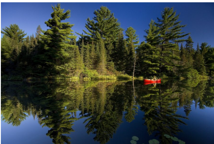
An old-growth white pine forest in Lady Evelyn-Smoothwater Provincial Park in Temagami, ON.