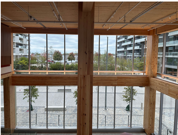
View of the atrium with exposed structural elements at T3 bayside.