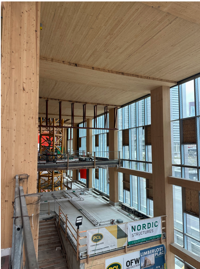
The atrium under construction at Limberlost Place.